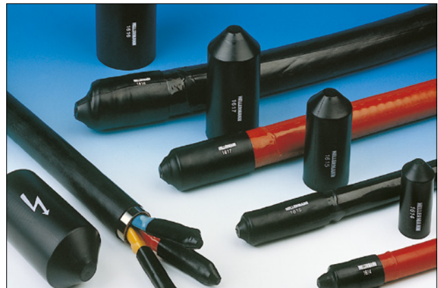
En passende endehette for alle kabeldimensjoner og -typer.